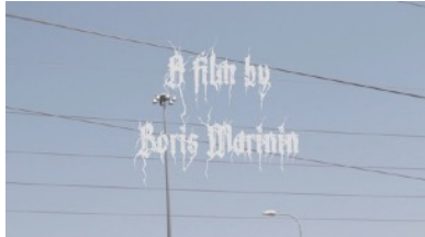
Horse 4:44 - In horror movies the dogs always bark at the demon's invisible presence., while the horses startle and a flock of birds shudders, astonished, into the air. They perceive in advance the arrival of the human's divided nature.