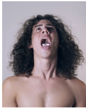
Word - A soundless video - performance showing a young man holding within his mouth a burning candle that is melting by the heat.