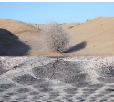
Bassia - A desert bush that spreads itself by rolling on the ground. Two spaces of different time and place. A reflection or replication that exists simultaneously under and above the ground.