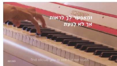
Sketches of Tel Aviv - Tel Aviv viewed from a new angle, based on a reference to an unusual building called "The Crazy House," as a laboratory in which a poem written by its author, is dismantled.