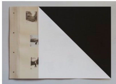
Paper & Scissors - An alteration of text fragments from the English edition of the artist's great grandmother's children's book. An object that contains memories, which function as a time capsule. The built-in language that bears the responsibility of transmitting the family's heritage in the album feels almost imaginary.