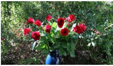
Flower - A testimony of a woman who lives in a Kibbutz near the Gaza border. Her humorously and apologetically testimony relates to an incident that occurred on one of the many occasions when rockets were fired on the Kibbutz.