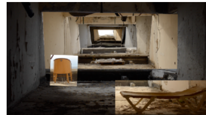
A Room With a View - The fluidity of memories of history through the attempt to tell the story of an abandoned hotel.