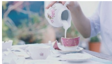
Kindertransport. - The video opens with an old photograph of the artist's great-grandfather during World War I, a Polish immigrant in German military uniform. During that war, after being tortured, he became insane and took his own life. His daughter, was then sent to Britain with the Kindertransport. Broken pieces of porcelain and crystal accompanied her in her onward journey immigrating to Israel, and even 50 years after, the world stands still at exactly 5 P.M. as the artist's grandmother pours tea with milk and relaxes.