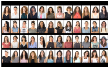
Present Perfect - A one channel video work based on a multi-channel video installation, which explores femininity by portraying young women trying to remain still, while posing in front of the camera for several minutes.